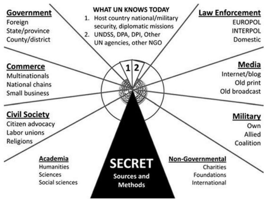
Figure 17.2 The UN and eight tribes of information—intelligence

Despite some significant progress during the tenure of Major- General Patrick Cammaert, The Royal Netherlands Navy, as Military Advisor to the Secretary-General, and the proven success of Joint Military Analysis centres (JMACs) and Joint Operations centres (JOCs), today the United Nations remains largely incapable of producing coherent intelligence (decision support) across all of its needs, inclusive of the specialized agencies. The world can, essentially, be divided into eight tribes, illustrated in Figure 17.2. They currently operate far too much in isolation.